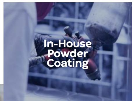
In-House Powder Coating