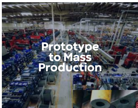
Prototype to Mass Production

For over 120 years, The Fi Company has operated as the largest sheet metal conversion company on the west coast and Tijuana, and Baja region.