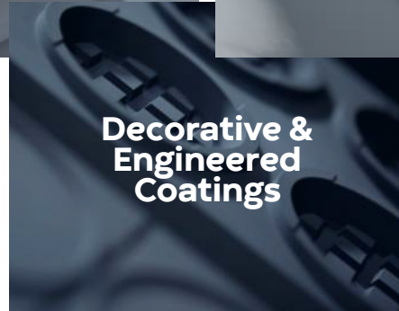
Decorative & Engineered Coatings