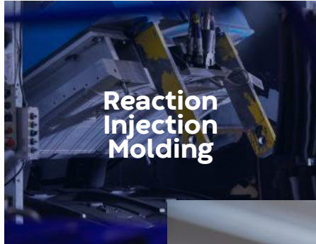
Reaction Injection Molding

Fi's portfolio of plastic manufacturing processes & expertise provides unparalleled flexibility in application, design, cost, lead time & styling options.