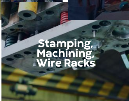
Stamping, Machining, Wire Racks