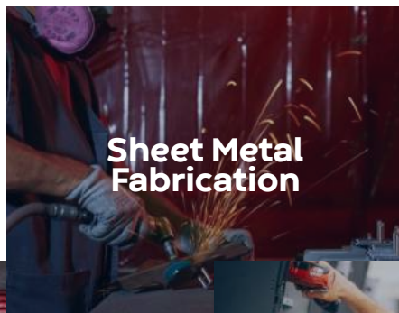
Sheet Metal Fabrication